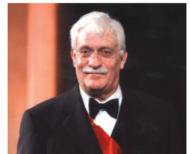
Ramond V. Damadian, M.D.

Incorporated in 1979, the company's research and development efforts are still actively led by Dr. Damadian with an aim to aggressively pursuing FONAR's corporate mission, which is to continuously develop and improve MR technology as an essential tool for diagnosis and patient care in modern medicine. Both the R&D and service teams are constantly monitoring customer satisfaction and approval ratings by developing systems and accessories that benefit patients as well as physicians. For the previous two decades, numerous competitors have followed FONAR's groundbreaking path, transforming MR into a leading diagnostic tool. In recognition of the company's longstanding role as a pioneering innovator of MR technology, Frost & Sullivan is proud to bestow upon FONAR the 2006 North American Medical Imaging Industry Innovation and Advancement of the Year Award.