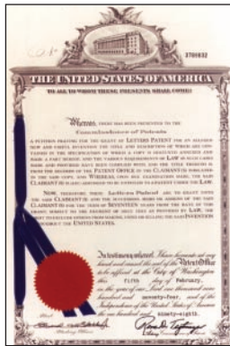
U.S. Patent 3,789,832

Following publication of the NMR-relaxation results in Science in 1971, the first patent for using NMR in cancer research as a medical body scanner was issued in 1972, followed by the first MR image of a tumor in a live animal in 1976. The emergence of a commercial MR industry began in 1977, with the introduction of the first superconducting magnet for human imaging developed by Dr. Damadian and his team at the State University of New York - Downstate Medical Center, in Brooklyn, NY. The scanner, appropriately titled Indomitable, is now on exhibit at the Smithsonian National Museum